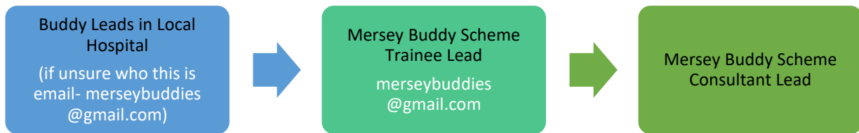
Figure 1- Escalation pathway for any issues with buddy scheme or wanting to change buddy pairings.

There may be times when either the senior or the junior trainee may want to end the buddy relationship. This may be because of a change in hospital placement, the senior trainee reaching the end of their training or that the junior trainee feels that they no longer require a buddy. If there are any other difficulties between the allocated pairs then please let us know and we can address these concerns or look to change pairings. Issues relating to the scheme can be escalated as summarised by the flowchart below: